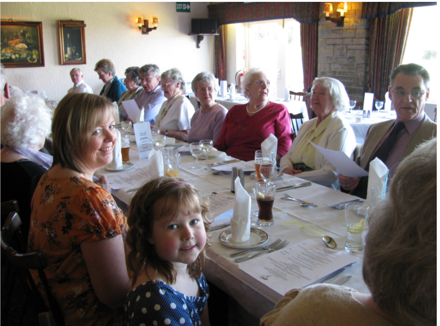
'Anniversary' lunch – April 2010